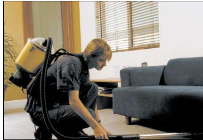
Clean Team staff will thoroughly clean all those 'nooks and crannies' that just seem to get missed by other companies.

With Clean Team you only deal with the same staff, this also ensures there will be fewer sets of keys in circulation and you will know who is cleaning your premises even when you are not there.