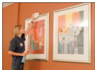
All pictures, furniture, window sills, and skirting boards will be dusted and cleaned.

Your paperwork will not be disturbed, as your desk is dusted down and polished. The general area of your working desk, filing system and other furniture will be dusted. All finger marks and smudges on doors, desks, light switches and glass will be spot cleaned.