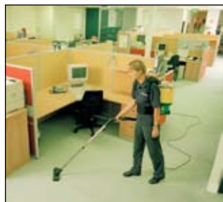
Your carpet will be vacuum cleaned and deodorised.

Your tiled or vinyl floors will be mopped and sanitised. Your tiled floors will be cleaned with industrial strength cleaners, mopped and dried. All marks on the tiled floors will be removed making your office area inviting because it looks clean. Your vinyl floors will be stripped using biodegradable cleaning solutions, cleaned and sealed.