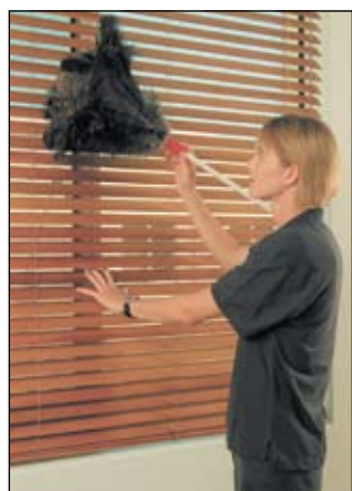
Blinds will be dusted regularly to keep them sparkling like new.

No spot will be left out as dust, cobwebs and unsightly marks will be cleaned and dusted. This is important as Clean Team will actually clean areas you cannot reach or see giving you peace of mind especially if you are allergic to dust.