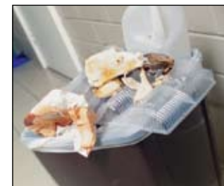
Kitchen bins will be emptied and scrubbed out.

We'll remove the dirt, food scraps and then thoroughly scrub them. We even re-line the bin and deodorise the area.