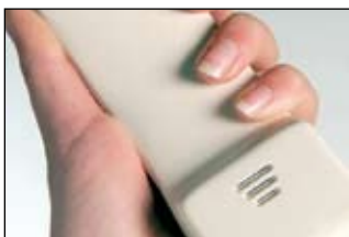
Your phones and hand pieces will be left squeaky clean.