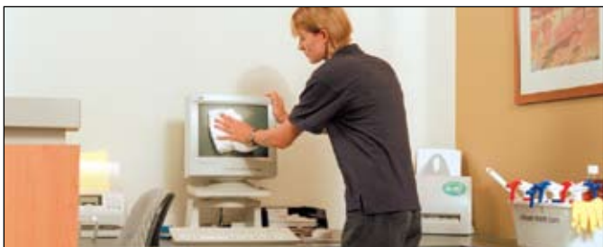
Your desk and work area will be thoroughly cleaned and polished without disturbing your paper work.

INSTANT ONLINE QUOTE AT www.cleanteamwa.com.au